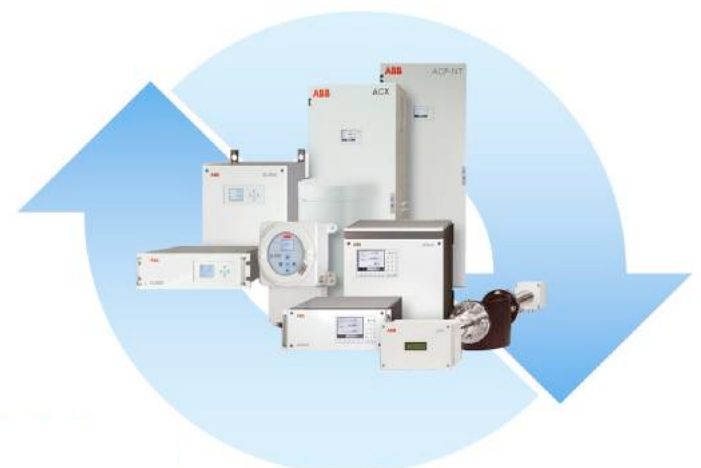
ABB provides all major international certificates for CEMS, hazardous area installations, metrological approvals, electrical safety and quality and environmental management.